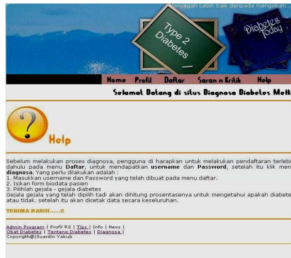
Figure 5.Help Menu Page