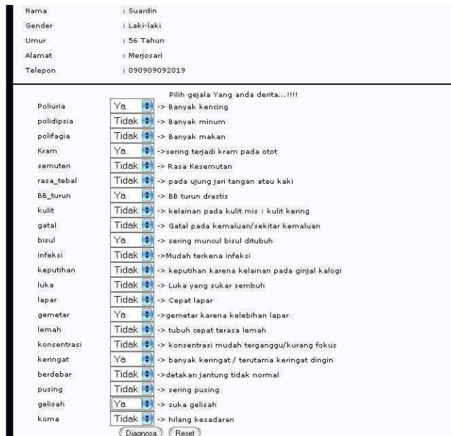
Figure 7. Symptom Select Page