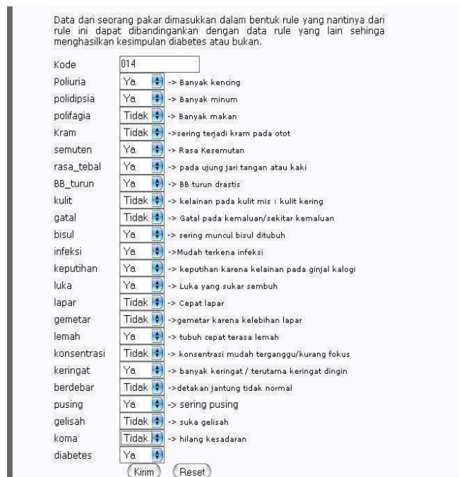
Figure 10. Rule Input Page

The input rule page is an admin work page to enter diabetes symptoms. The page design is as follows: