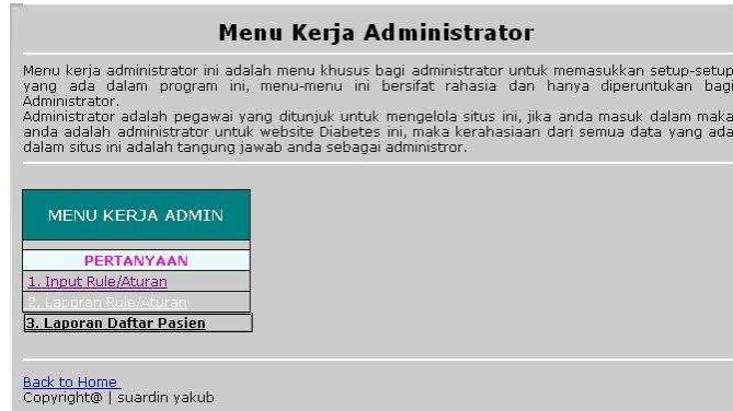
Figure 9. Admin Home Page