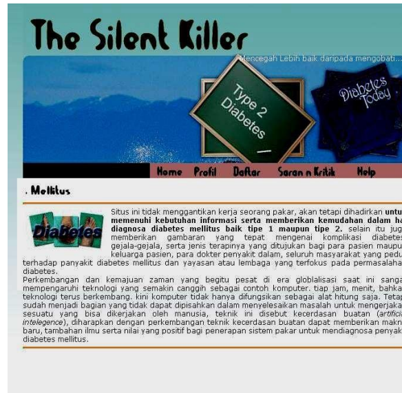
Figure 1.Home Menu

The page on the home menu is the initial display when the program is run, where in this home there is a description of the purpose of making the program as well as information about diabetes. The page designs are: