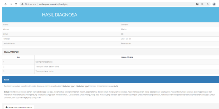
Figure 3. Output Result

After implementing the Dempster Shafer method, a system is implemented that serves to present the program results from expert system research to diagnose diabetes using the Dempster Shafer method. The output display is a display of the results of the Dempster Shafer process. The following displays the output page of the previously inputted data.