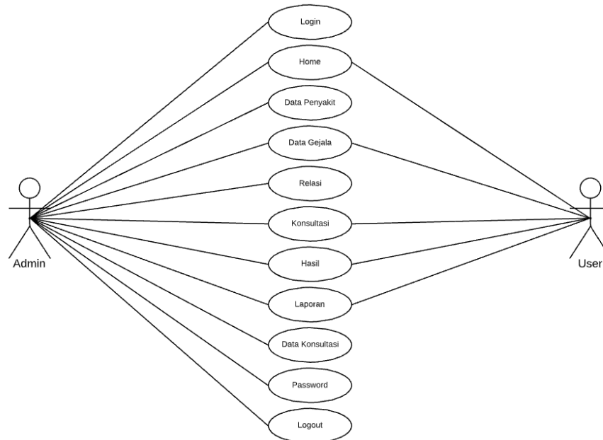
Figure2. Use Case Diagram

After implementing the Dempster Shafer method, a system is implemented that serves to present the program results from expert system research to diagnose diabetes using the Dempster Shafer method. The output display is a display of the results of the Dempster Shafer process. The following displays the output page of the previously inputted data.