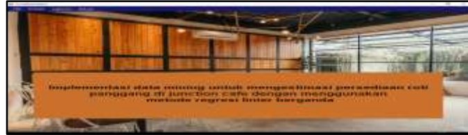
Figure 2. Form Main Menu