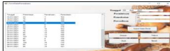
Figure 3. Inventory Data Form

Inventory Data Form is a form used to manage Inventory Data in the System. The following is the Inventory Data form display: