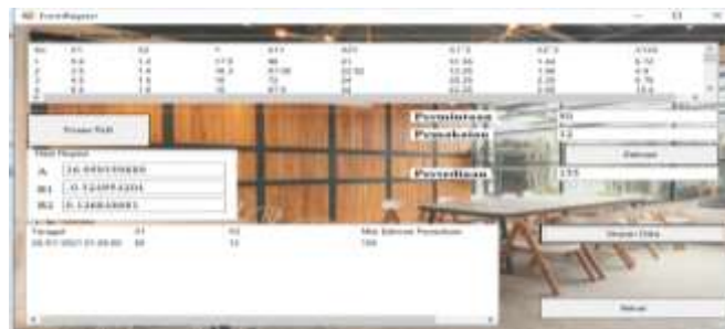
Figure 7. Form Regresi