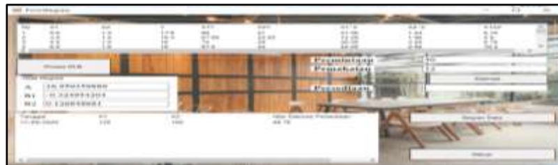
Figure 4. Form Regresi

Regression Form is a form used to find Sales Estimates. The following is the appearance of the Regression Form: